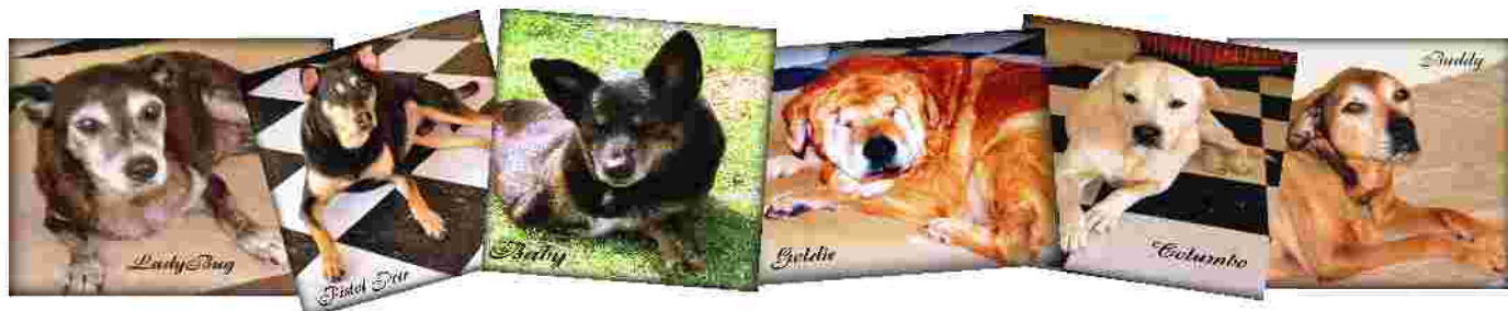
The current residents of Shadow's Rest are: LadyBug, Columbo, Knuckles, Boo, Goldie, Dingo, Stacy, Baby, Blackie, Monster, Moses, Nora, Eddie, Theo & Buddy. (some pictured above) They would love it if you came by to say hello.